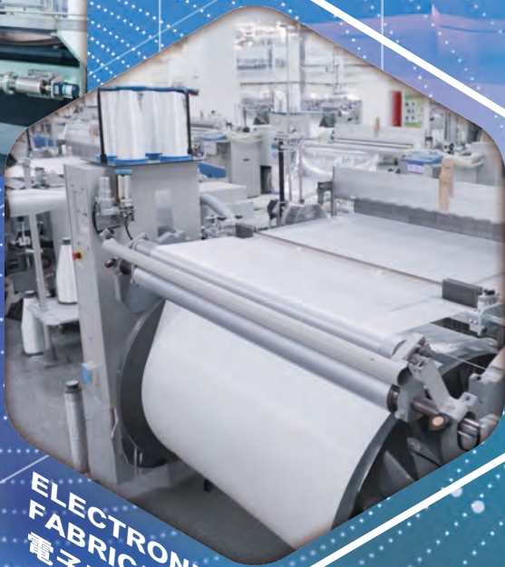
ELECTRONIC FIBREGLASS FABRIC/YARN 電子玻璃纖維布/紗

AI Materials One-Stop Shop Solution AI 材料一站式服務方案