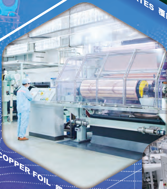
COPPER FOIL 銅箔